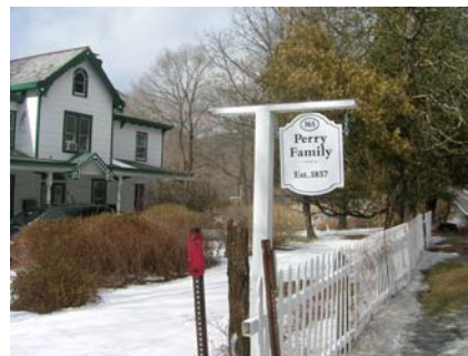
Preserving our links to the past