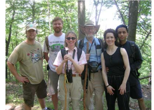
Enjoying nature together