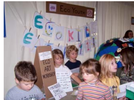
Creating a sustainable future