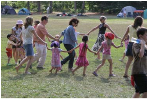
Celebrating our connections to each other