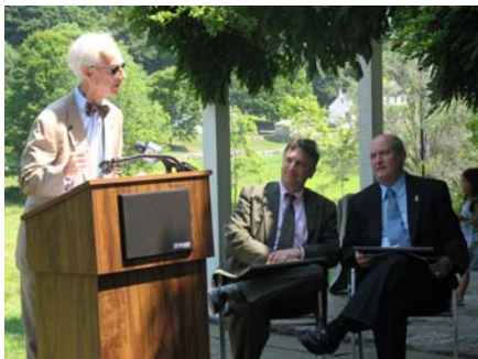
Working toward positive change