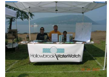
Protecting our natural resources