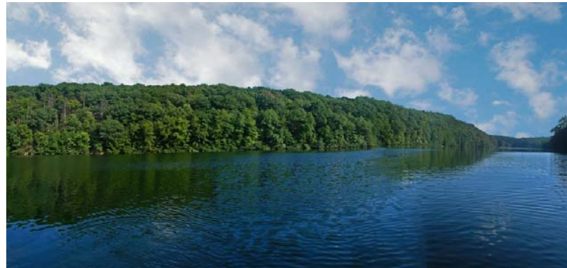
Conserving the land we love